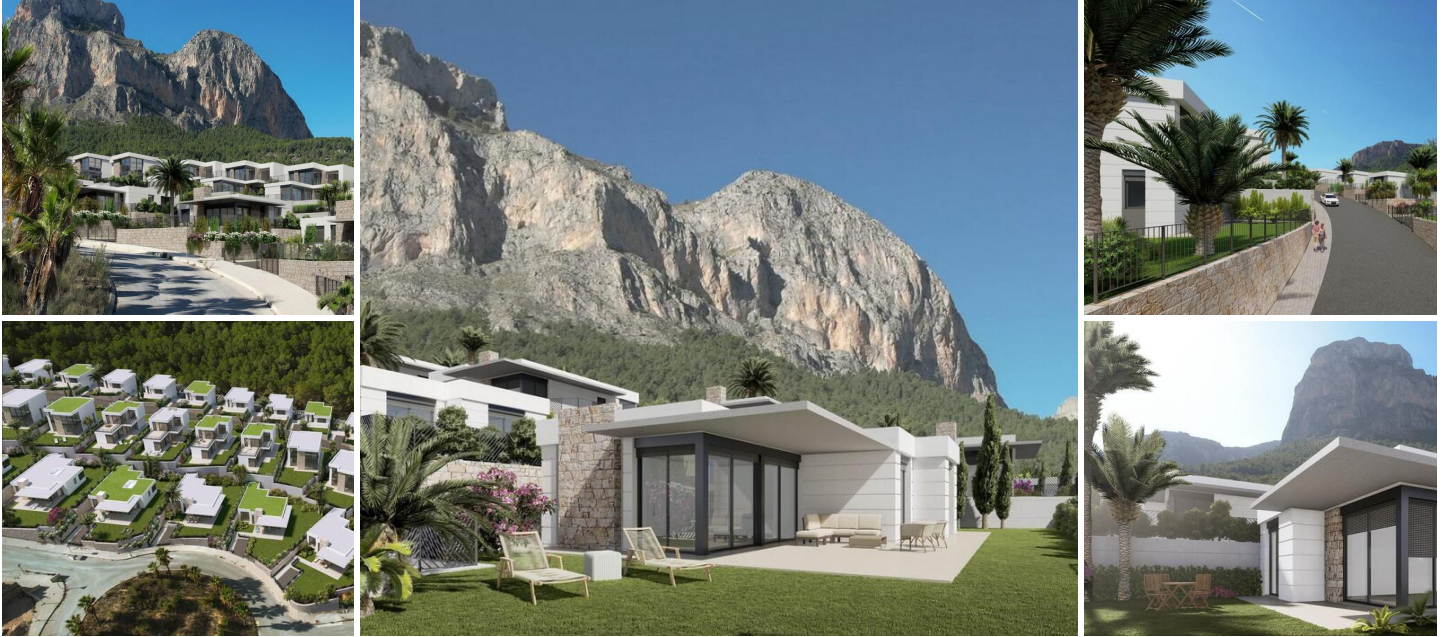
New Construction Villas in Polop, Alicante