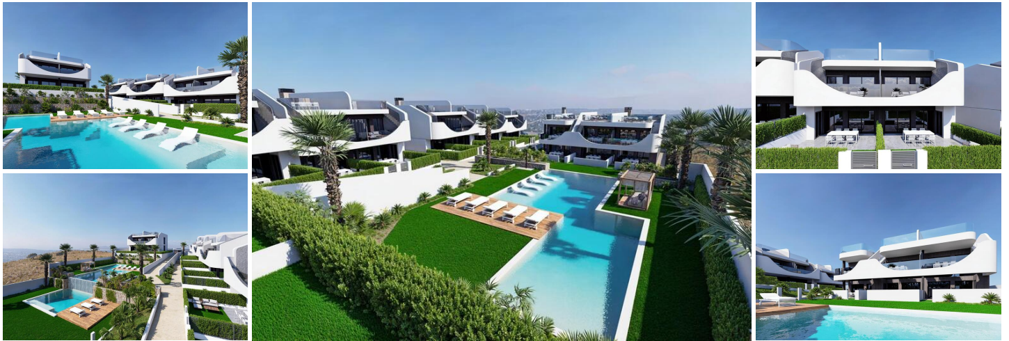
Bungalows of New Construction in San Miguel de Salinas - Nature, Golf and Comfort