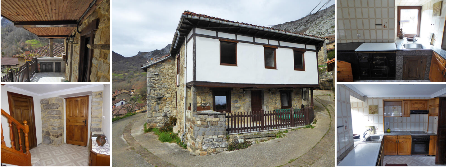
Village house in Calaeo

A lovely habitable old stone house for sale in the beautiful village of Calaeo, in the heart of the Redes Natural Park. The location on the top edge of this medieval village assures some amazing views and since this is the end of the valley, tranquility is guaranteed because there are no passing cars to disturb the peace. The roads in the village are narrow but you can still drive straight up to the property which has a garage and a handy parking space at the side. The house is the end of a row of terraces and faces both east and south towards the mountains. The lovely covered patio in front of the house is a large enough space to accommodate a seating area to enjoy those stunning views and there's also a small kitchen worktop with some storage cupboards and a sink, ideal for outside BBQs.