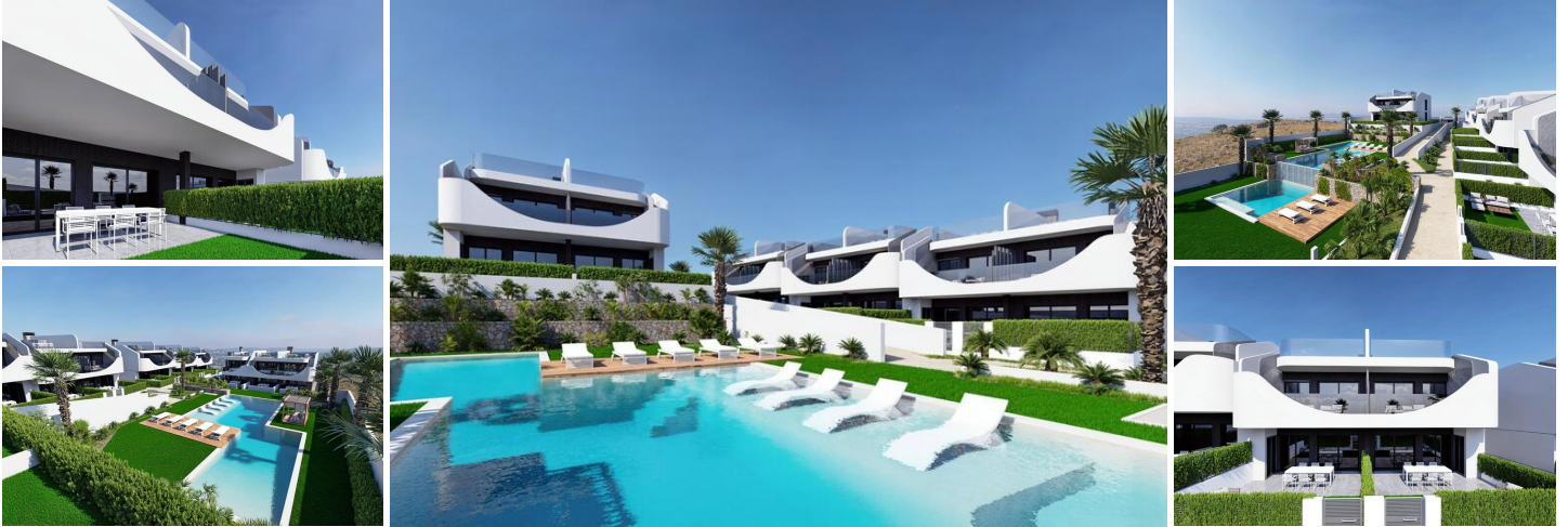
Bungalows of New Construction in San Miguel de Salinas - Nature, Golf and Comfort