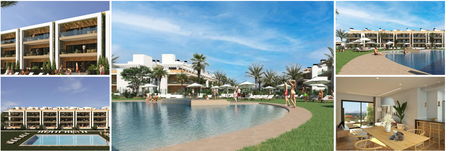
NEW BUILD RESIDENTIAL COMPLEX NEAR LA SERENA GOLF, LOS ALCAZARES

This amazing complex will be formed by 244 apartments with 2 and 3 bedrooms, divided in 8 blocks and 20 private Villas.