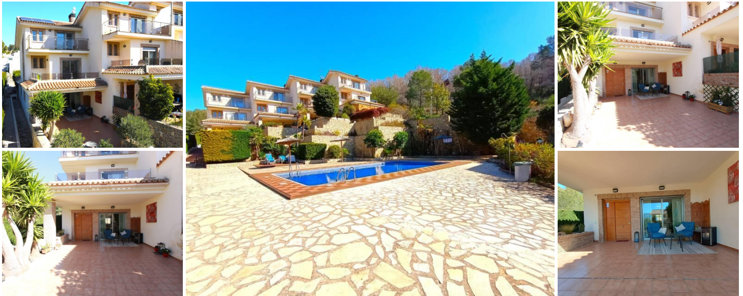
Townhouse in quiet residential with pool and mountain views

This cozy residential is made up of townhouses surrounded by nature, offering a quiet environment with panoramic views of the mountains. Its location is ideal, just 4 km from the beaches of Calpe, less than 10 minutes by car from both Calpe and Benissa, where you will find supermarkets, restaurants, shops and leisure areas.