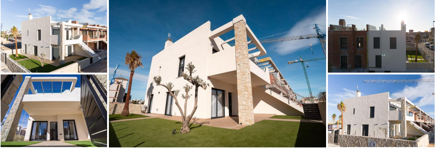
New Build Bungalows and Villas in Pilar de la Horadada