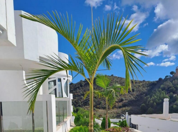
Modern Renovated Residences in Rincón de la Victoria – Just 1.2 km from the Beach

Discover this exclusive residential complex in Rincón de la Victoria, Málaga, offering newly fully renovated homes just 1.2 km from the stunning beaches of Torre de Benagalbón. Originally built a few years ago, these residences have undergone a complete interior refurbishment, including new plumbing and electrical installations, making them brand-new for first occupancy. Once reserved, your home will be ready for delivery within just 4 to 6 months.