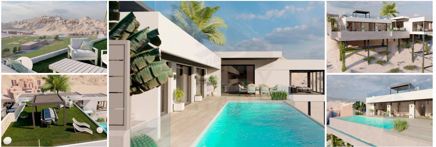
Luxury Modern Villas with Golf Course Views in Ciudad Quesada