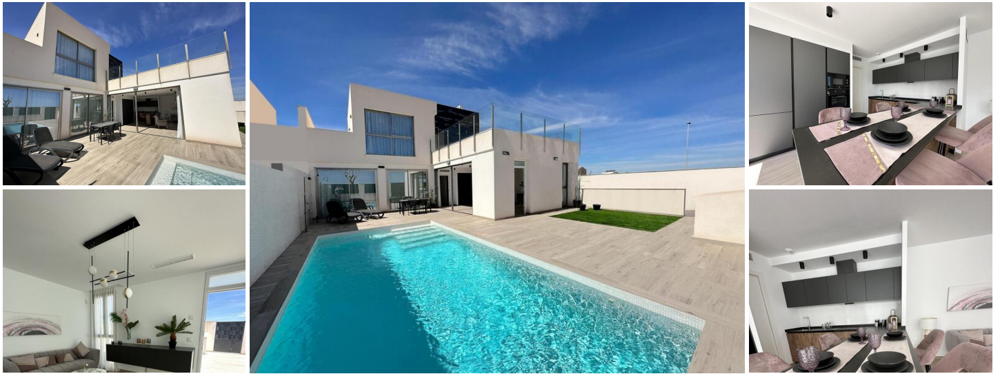
NEW BUILD SEMI-DETACHED VILLAS IN LOS BELONES

New Build Semi-detached villas in Los Belones, Mar Menor.