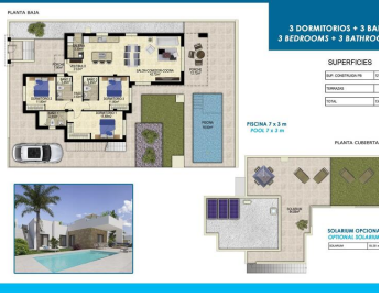
Stunning New Build Villas in Polop with Sea Views

Modern Villas with Spacious Plots and Private PoolsDiscover these exclusive new-build villas in Polop, located on large plots starting from 351 \text{ m}^2 . These homes offer a perfect blend of modern design, comfort, and breathtaking sea views. Each villa features a 7x3m private swimming pool with a sunbathing area, a large terrace and porch, and private parking space, making it the ideal retreat for those seeking both tranquility and luxury.