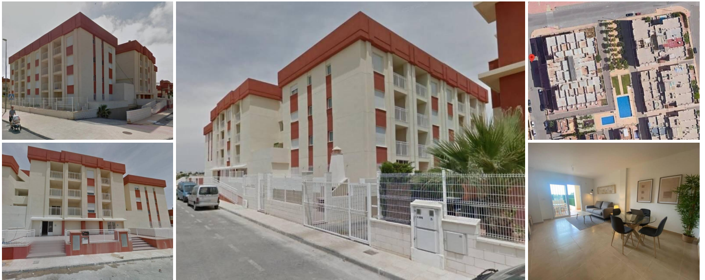
Regenerated Residential Complex in Lomas de Cabo Roig – Renovated Apartments