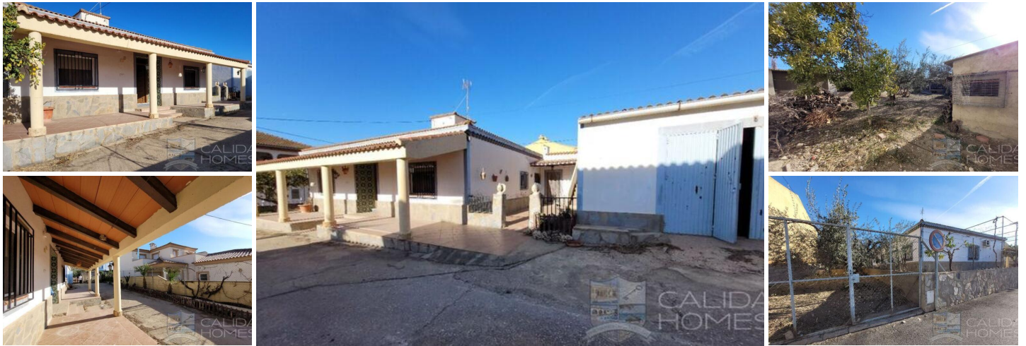
Villa Carrie – Sorbas

A charming detached 4 bedroom, 1 bathroom villa with garage located in the serene community of Los Martinez, Sorbas, Almeria, Spain.