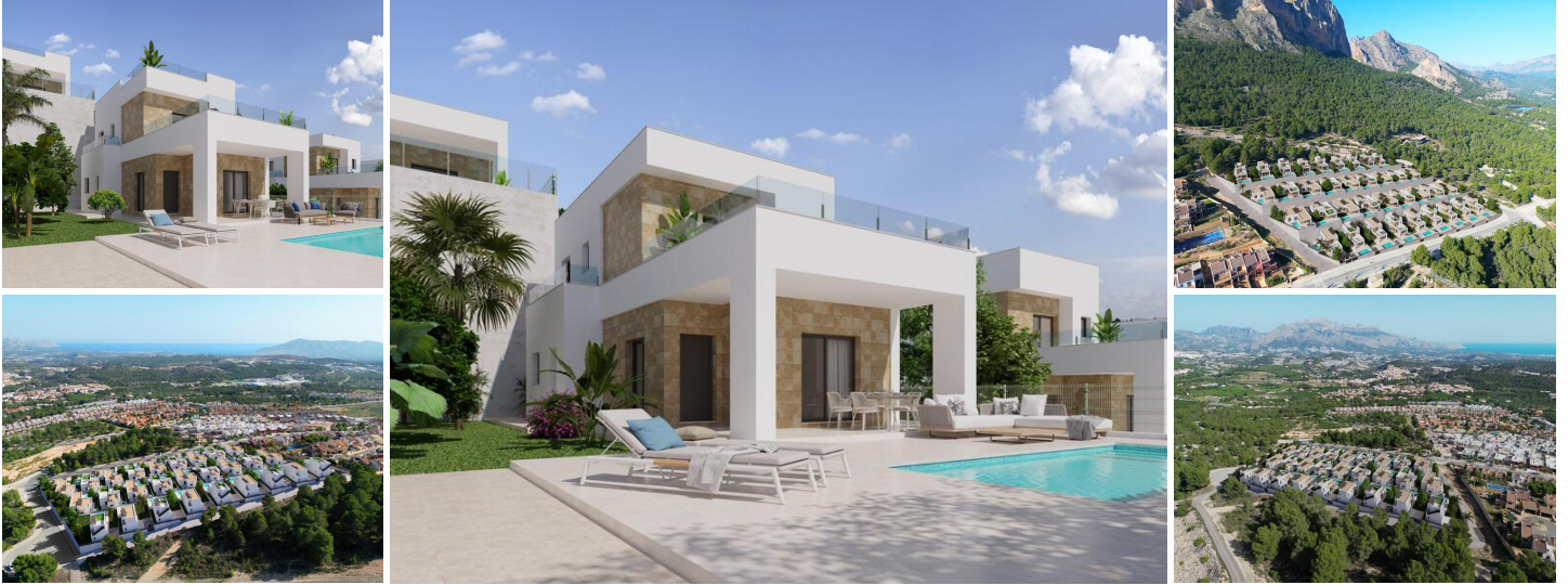
Stunning New Build Villas in Polop with Sea Views