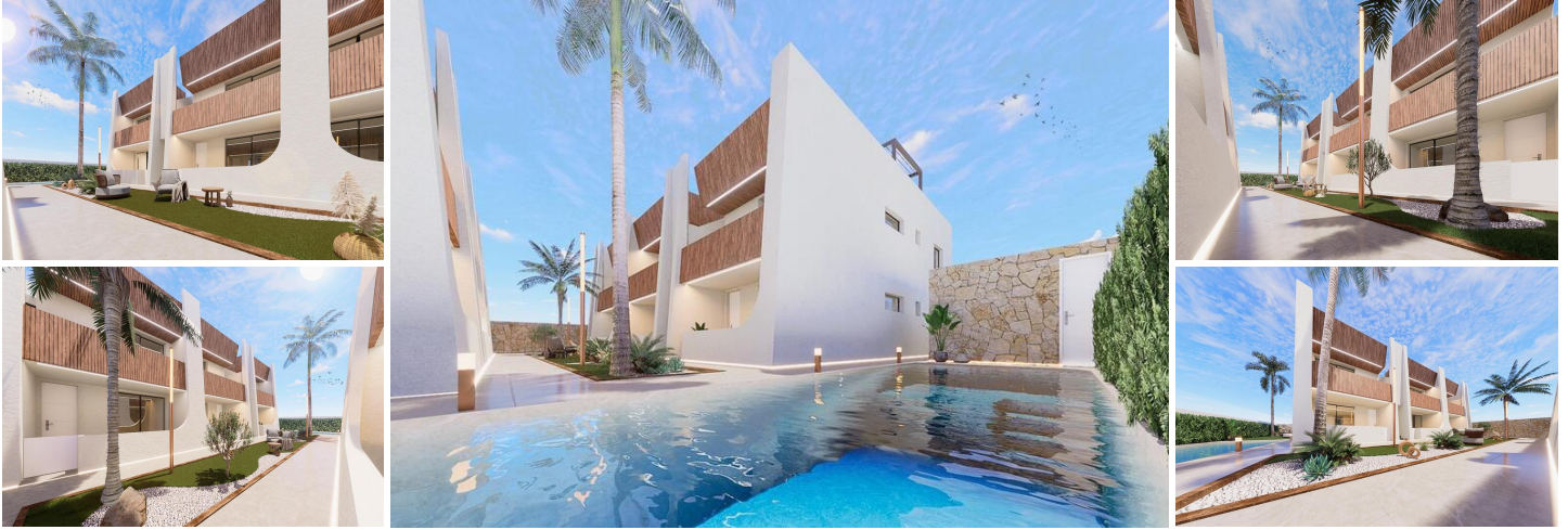
New build bungalows in san pedro del pinatar

New Build residential complex of signature style bungalow apartments in San Pedro del Pinatar.