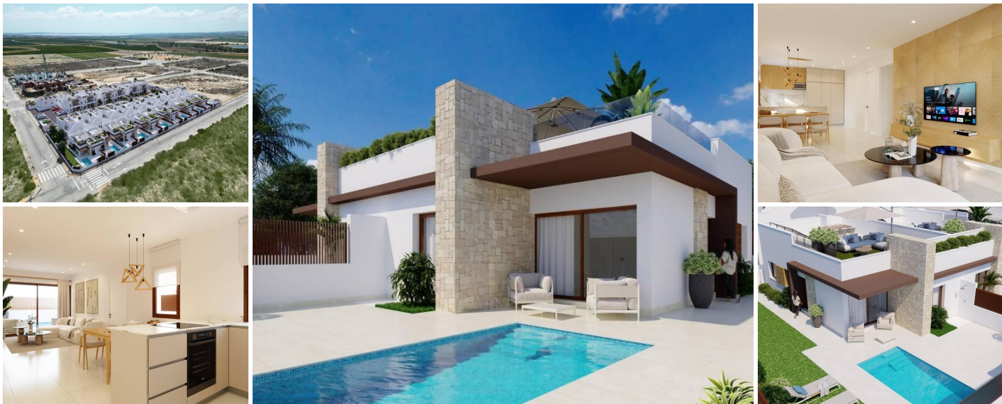
New Build Homes in Vistabella Golf Resort, Orihuela