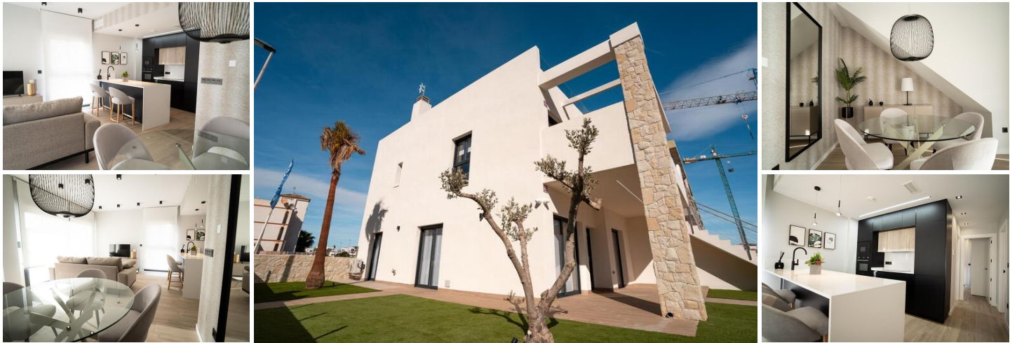
New build bungalows in Pilar de la Horadada