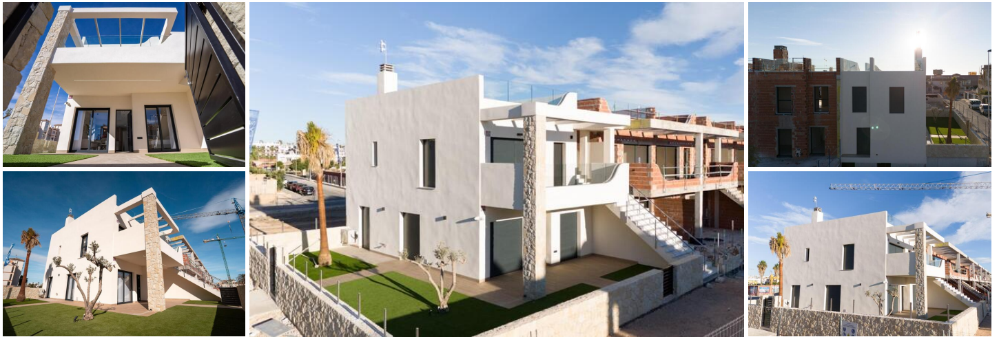
New build bungalows in Pilar de la Horadada