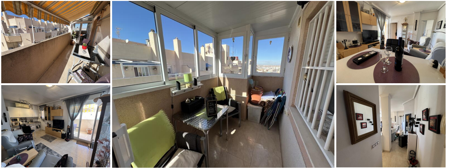
Bright Penthouse with Views of the Salt Lagoon in Torrevieja

This 55m 2 penthouse features 2 bedrooms, 1 bathroom, a living-dining area, and an open-plan kitchen. Its standout feature is the sunny 16m 2 terrace with stunning views of the salt lagoon, perfect for enjoying the Mediterranean climate.