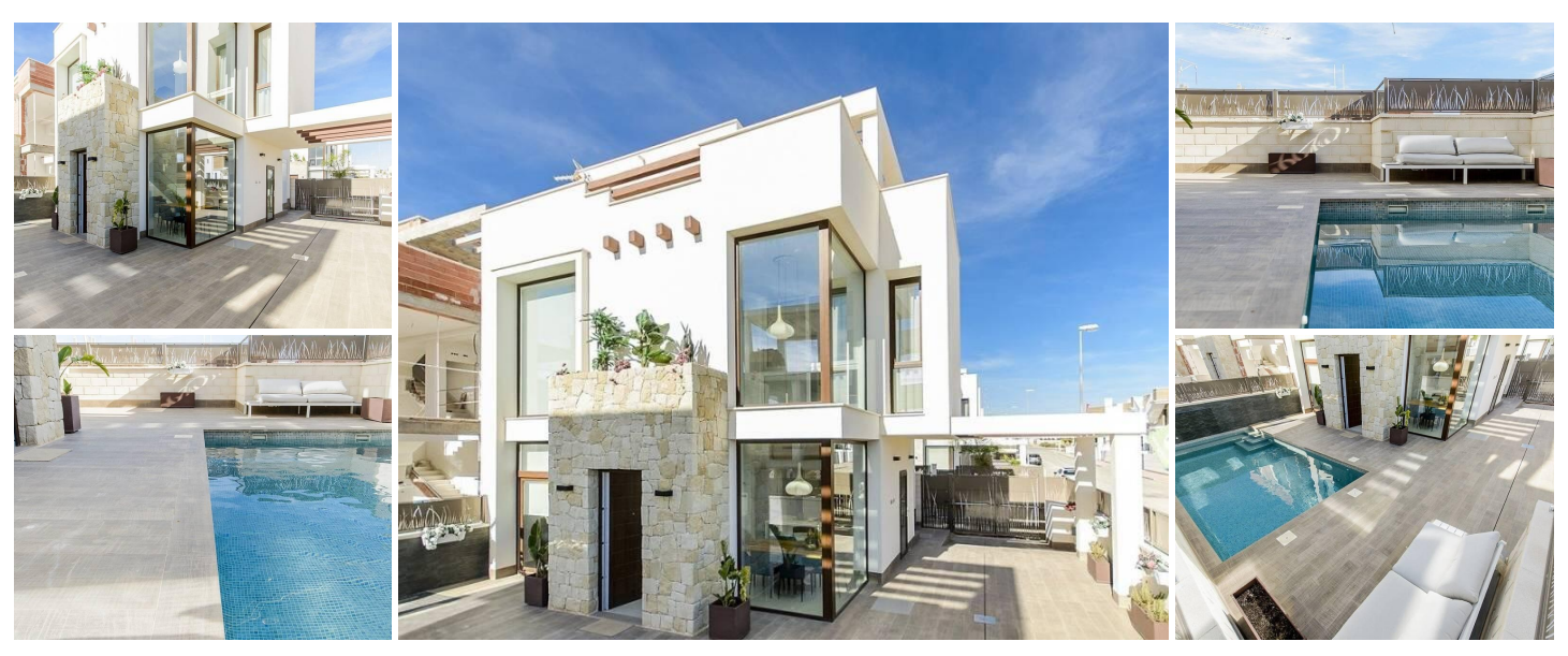
NEW BUILD VILLAS IN PLAYA HONDA!!!

Villas with private pool and solarium, with optional basement and garage at an extra cost.