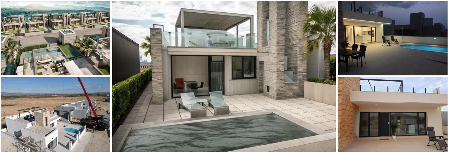
NEW BUILD TOWNHOUSES IN FUENTE ALAMO, MURCIA

New Build residential of villas and townhouses in in Fuente Álamo, Murcia.