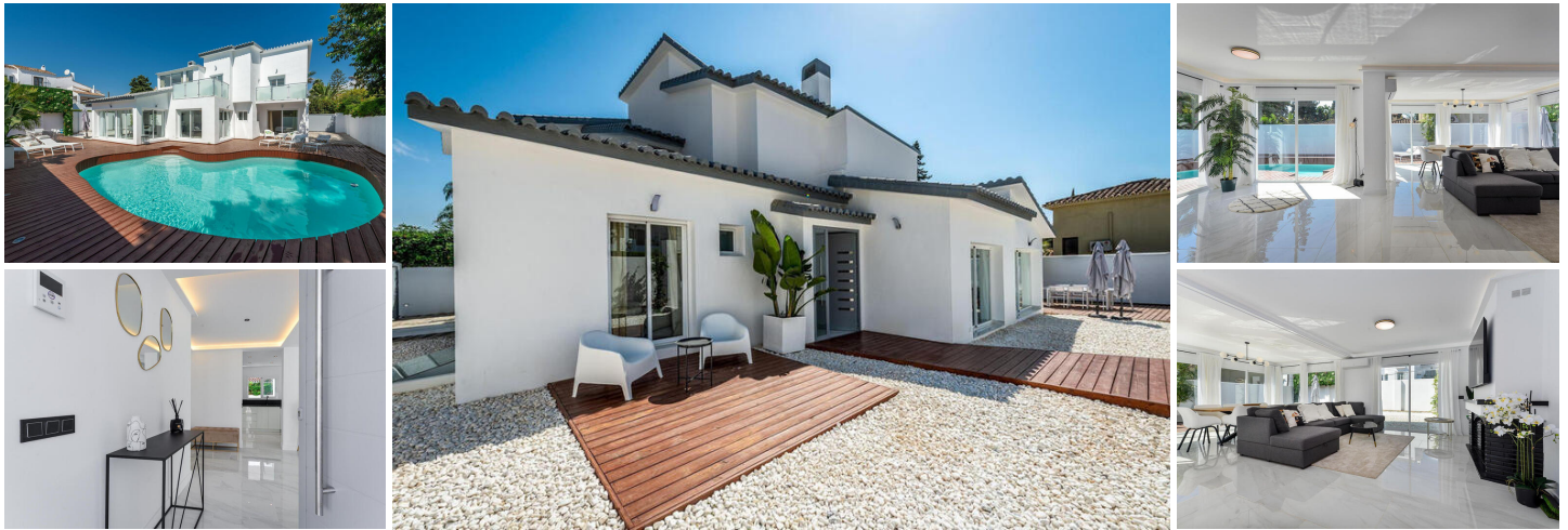
Villa Clara - El Paraiso (New Golden Mile)

Ideal location for this fully detached villa renovated in 2023, just 800m from the sea and 8 minutes from Puerto Banus.