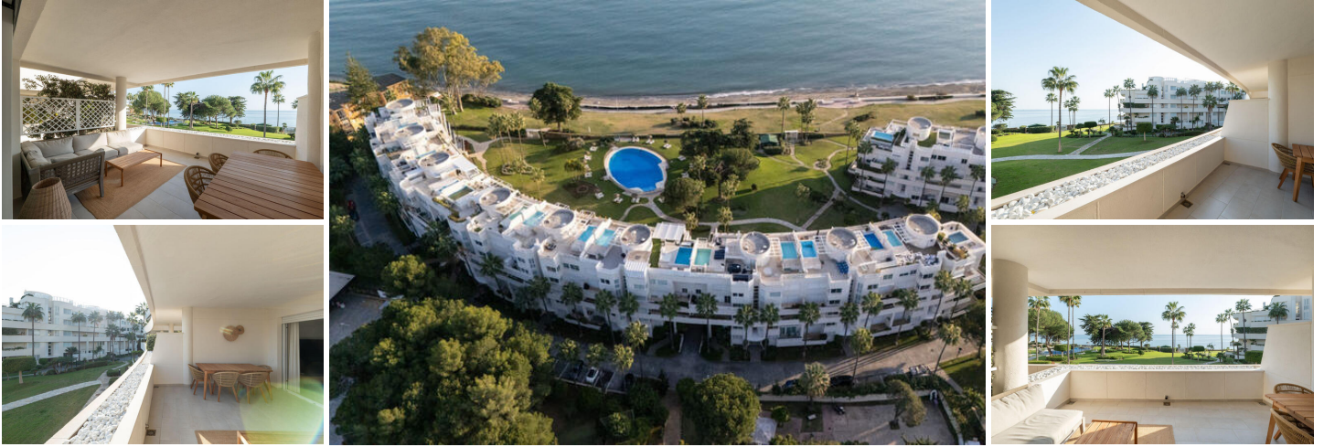
Luxurious Ground-Floor Apartment with Stunning Sea Views in New Golden Mile

A spacious, bright, and fully renovated ground-floor apartment with a modern design and stunning direct views of the sea and the complex. This property features 2 bedrooms, 2 bathrooms, and a terrace, perfect for enjoying the breathtaking scenery.