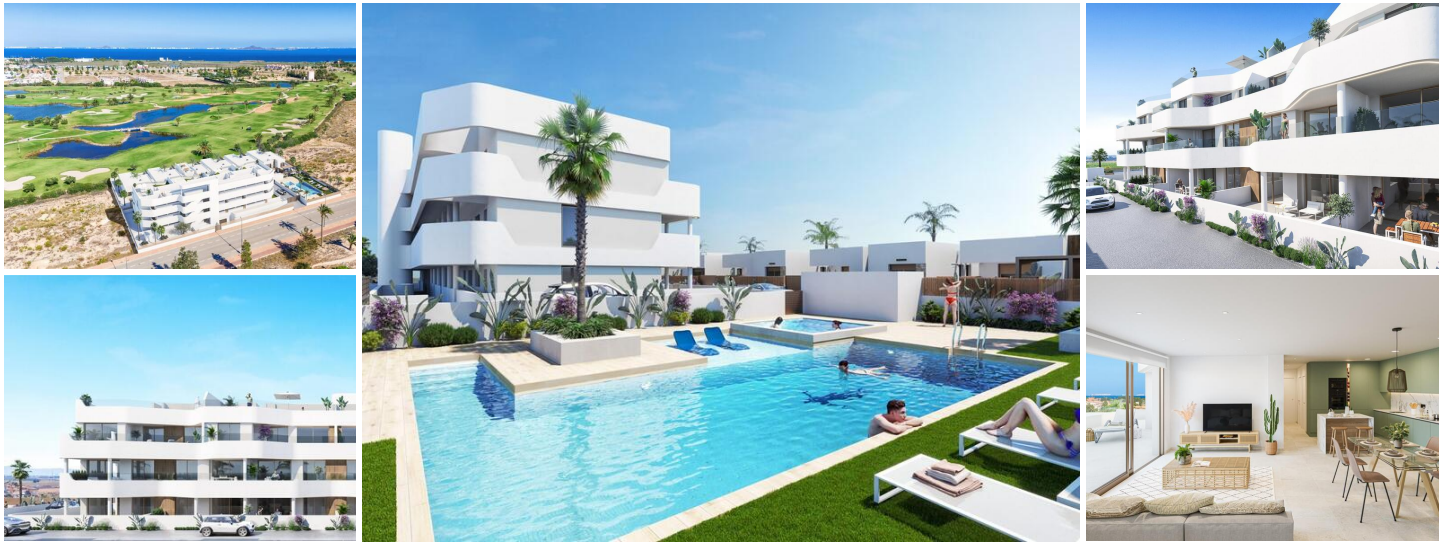
New Build Residential complex in Los Alcazares

Los Alcázares is an idyllic location for those looking to invest in a new residential property on the Costa Cálida. Just 25 minutes from Murcia Airport and approximately 55 minutes from Alicante Airport, this area is conveniently connected by highway to major cities like Cartagena, Murcia, and Alicante, as well as to other beautiful beaches along the Costa Cálida and Costa Blanca.