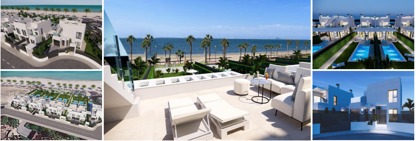
Luxury New Construction Villas on the Waterfront in Los Alcázares

Discover the ultimate in Mediterranean living with this exclusive residential project, featuring nine contemporary villas located directly on the waterfront in the beautiful coastal town of Los Alcázares, Murcia. Situated in the sought-after Nueva Ribera area, these villas are designed for luxury, privacy, and convenience, with nearby access to golf courses, shopping centers, and transportation hubs. Each villa offers high-end finishes, breathtaking sea views, and a private pool, making them the ideal choice for those seeking a modern coastal retreat.