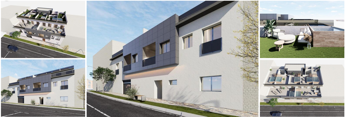
New Build Apartments in Pilar de la Horadada with private Jacuzzi