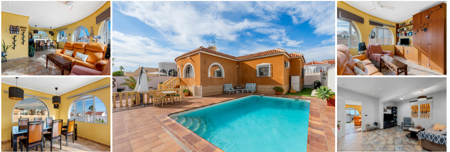
4 bedroom villa with private pool in Ciudad Quesada

Welcome to this property, situated on a 500 m 2 plot with a built area of 158 m 2 . This property features 4 bedrooms and 2 bathrooms, making it ideal for families.