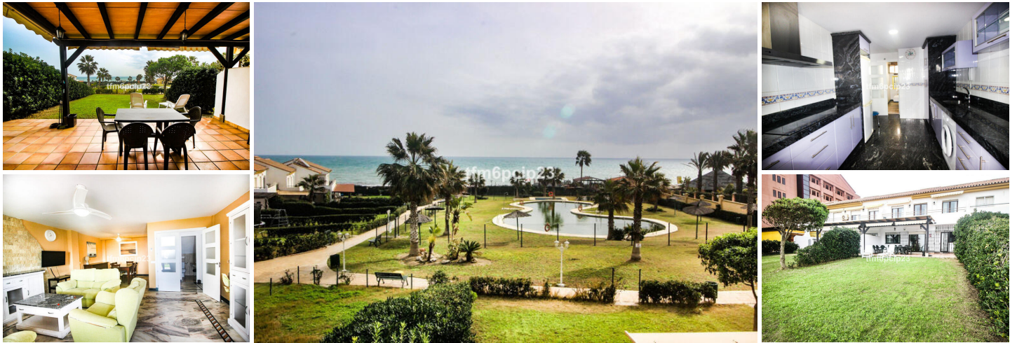
LA DUQUESA MANILVA BEACH SIDE TOWNHOUSE FRONT SEE VIEWS

This light and airy townhouse is located right on the beach in this lovely gated community just a short distance to the lovely Port of La Duquesa and only 30 minutes drive to Gibraltar Airport. There are 4/5 bedrooms, a communal pool, children's pool, tennis courts, has parking for 2 cars and can accommodate up to 8 people. The property is completely equipped and has hot and cold air conditioning. Another added benefit is that there are 2 terraces and a fenced communal garden from which to enjoy the sun.