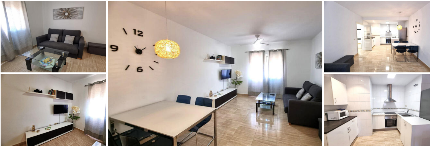
Beautiful Apartment in the Heart of Sabinillas

This charming apartment is located in the center of Sabinillas, with all amenities at your fingertips and just a 5-minute walk from the beach.