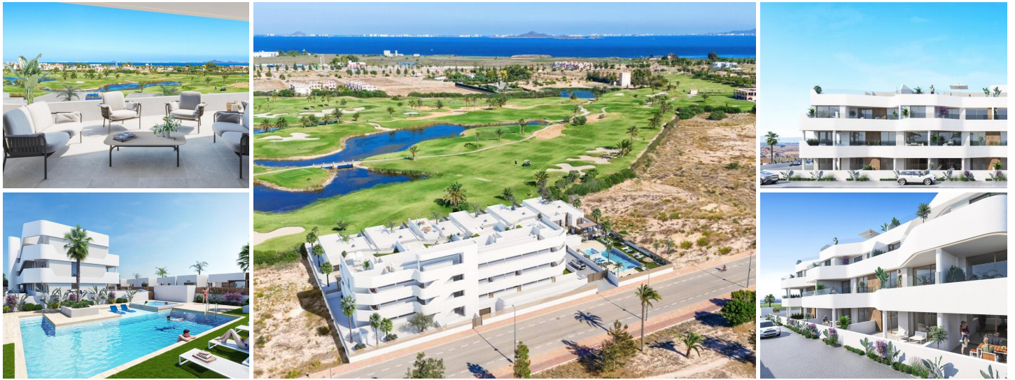
New Build Residential complex in Los Alcazares

Los Alcázares is an idyllic location for those looking to invest in a new residential property on the Costa Cálida Just 25 minutes from Murcia Airport and approximately 55 minutes from Alicante Airport, this area is conveniently connected by highway to major cities like Cartagena, Murcia, and Alicante, as well as to other beautiful beaches along the Costa Cálida and Costa Blanca