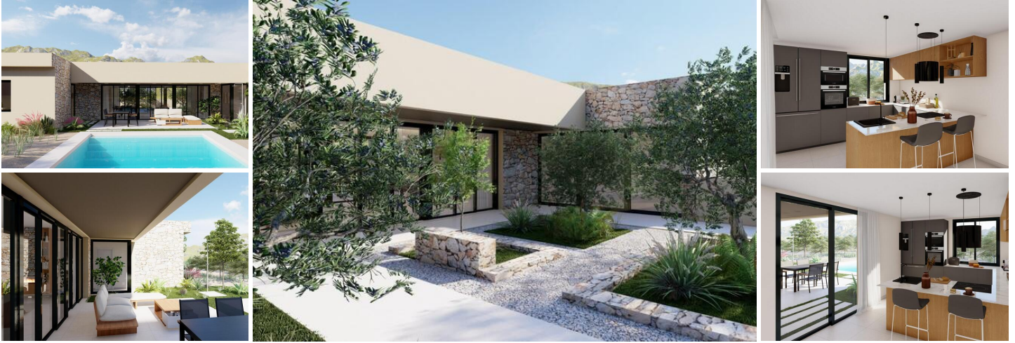
NEW BUILD VILLA IN YECLA, MURCIA

New Build exclusive luxury villa located within a beautiful vineyard in Yecla, Murcia