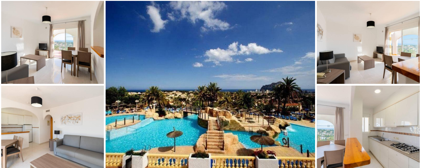
GROUND FLOOR BUNGALOW APARTMENTS IN CALPE

Beautiful top floor bungalow apartments with 2 bedrooms, 1 bathroom, open plan kitchen with the lounge area, fitted wardrobes and terraces.