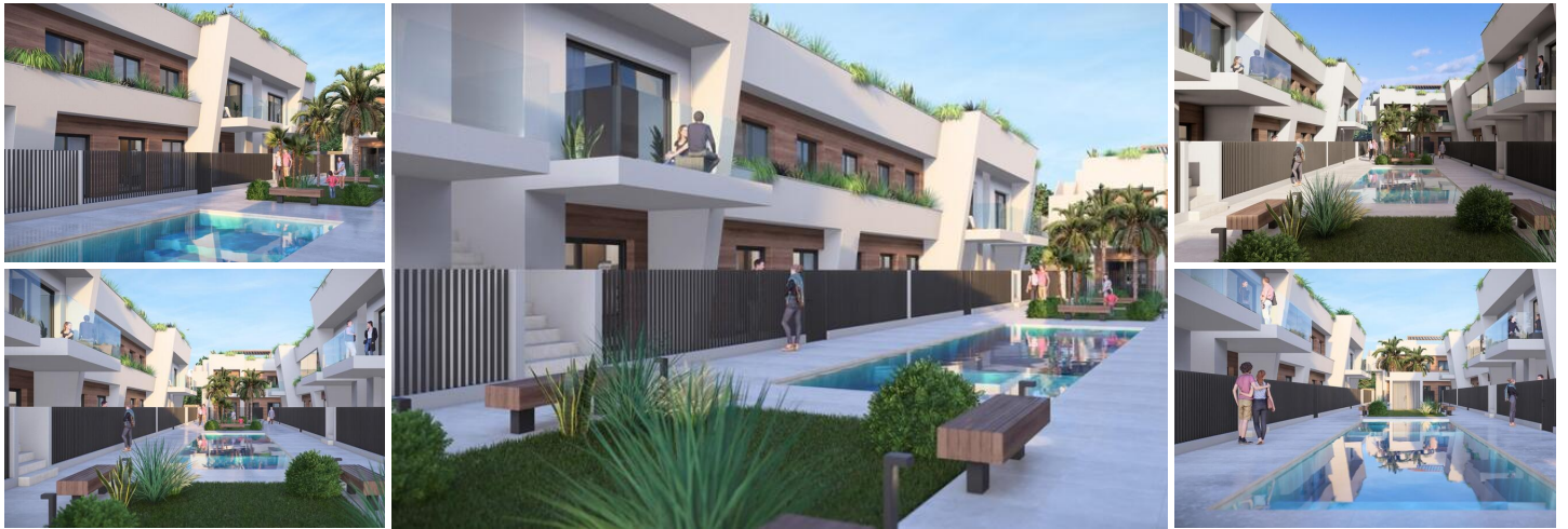
New Construction Homes in Torre-Pacheco, Costa Cálida