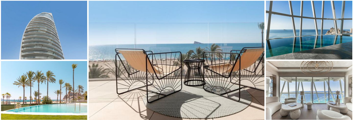
LUXURY SEAFRONT APARTMENTS IN BENIDORM

Unique New Build Luxury Key Ready residential on the Poniente beachfront, Benidorm