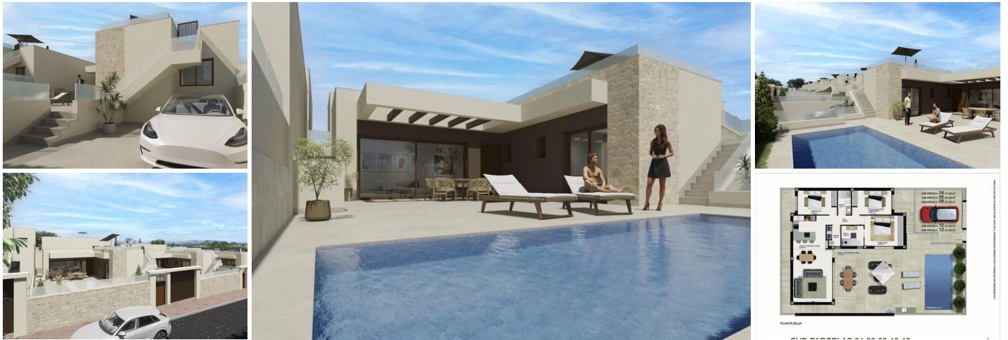
Modern New Villas for Sale Near La Marquesa Golf Course in Ciudad Quesada

Discover these 14 newly constructed villas located near the prestigious La Marquesa Golf Course in Ciudad Quesada, an ideal location for golf enthusiasts and those looking for a peaceful, vibrant neighborhood. These single-story villas offer a modern and functional design, perfect for families or as vacation homes.