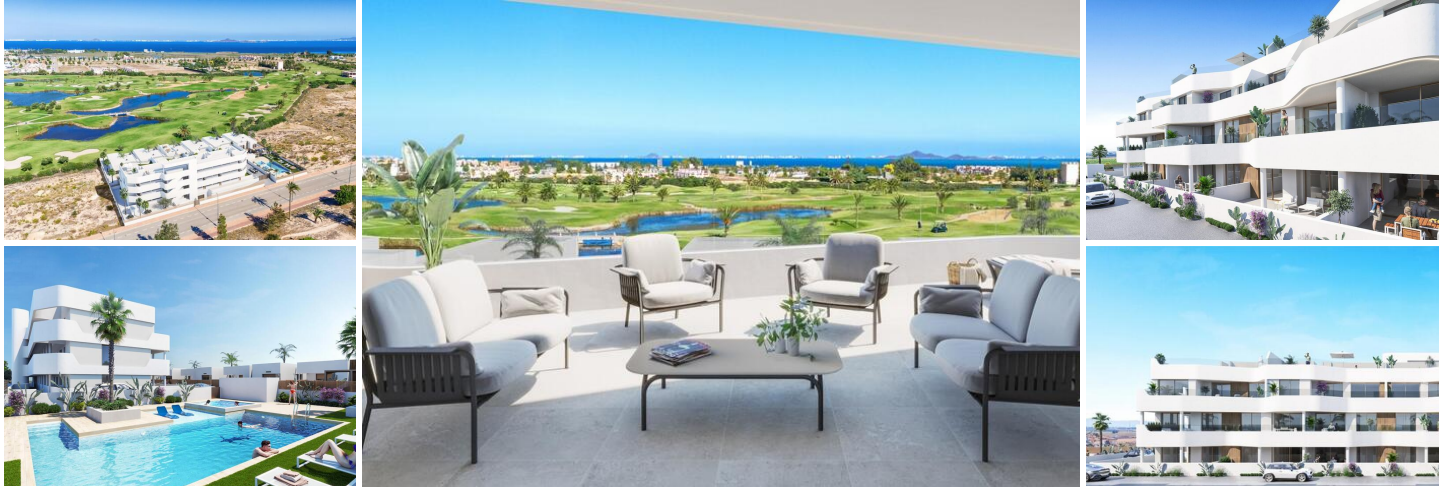
New Build Residential complex in Los Alcazares

Los Alcázares is an idyllic location for those looking to invest in a new residential property on the Costa Cálida. Just 25 minutes from Murcia Airport and approximately 55 minutes from Alicante Airport, this area is conveniently connected by highway to major cities like Cartagena, Murcia, and Alicante, as well as to other beautiful beaches along the Costa Cálida and Costa Blanca.