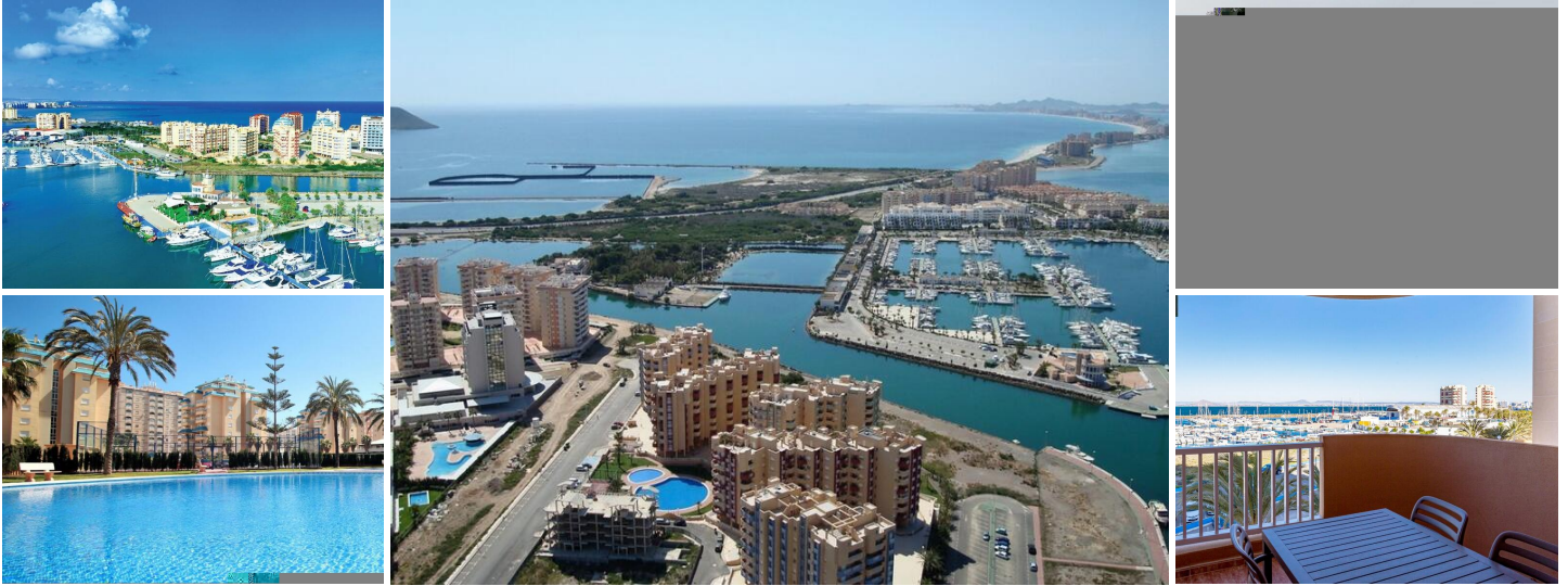
BEAUTIFUL SEA VIEW APARTMENTS IN LA MANGA

This urbanization is located in the largest expansion area of La Manga.