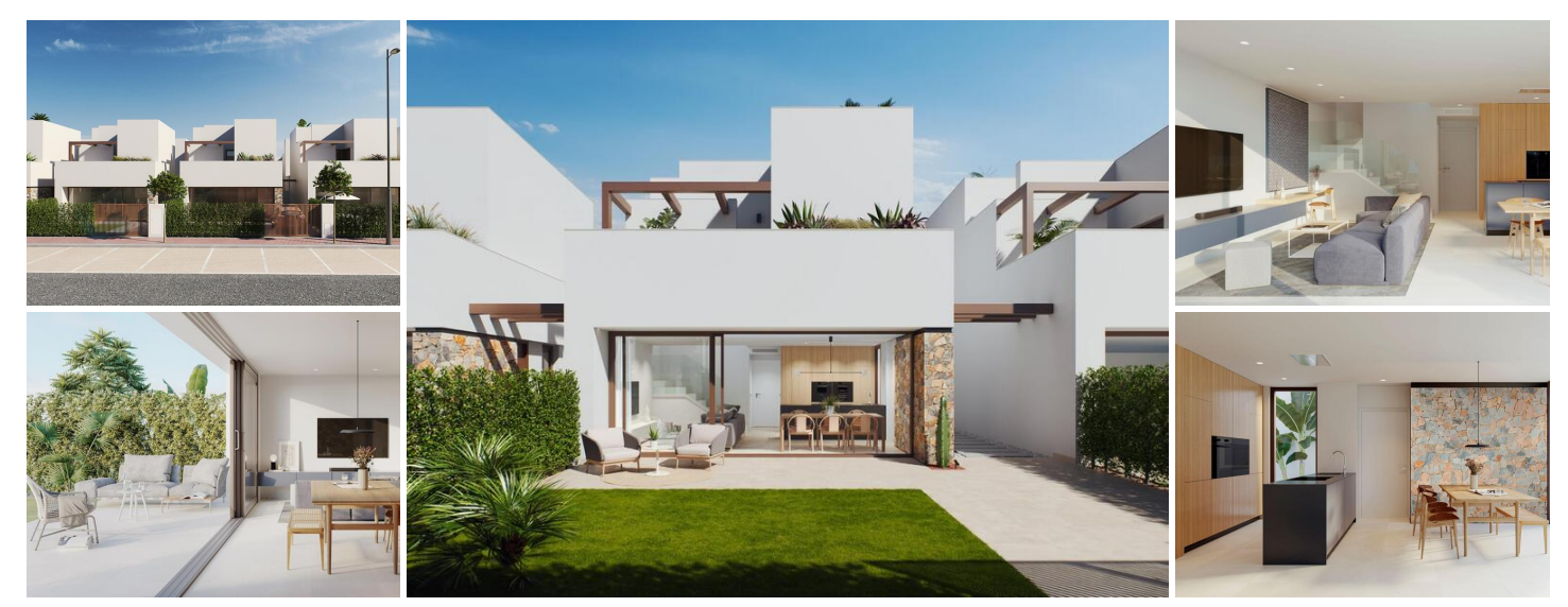
New Build Villas in Exclusive Gated Resort in Murcia, Near Mar Menor Beach

Prime Location in the Heart of Murcia's Scenic Coastline