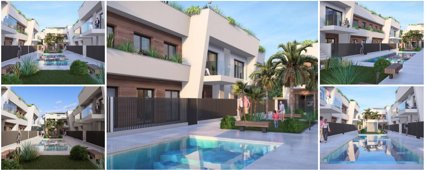
New Construction Homes in Torre-Pacheco, Costa Cálida