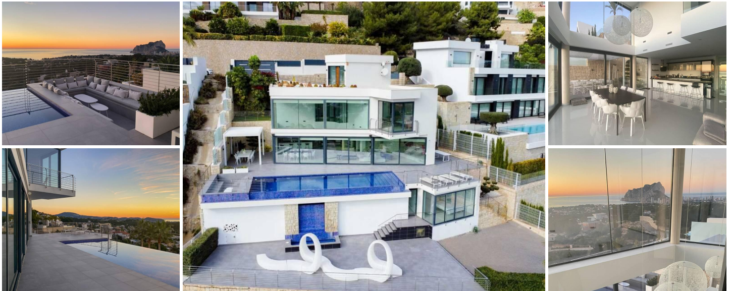
Luxury Villa in Raco de Galeno - Breathtaking Sea Views and Unprecedented Luxury

In the prestigious residential area of Raco de Galeno, just 1,500 meters from the Mediterranean Sea, stands this extraordinary villa that offers everything you could want. With spectacular sea views, the iconic Peñón de Ifach, and unparalleled design, this is the property for those looking for ultimate luxury and comfort.