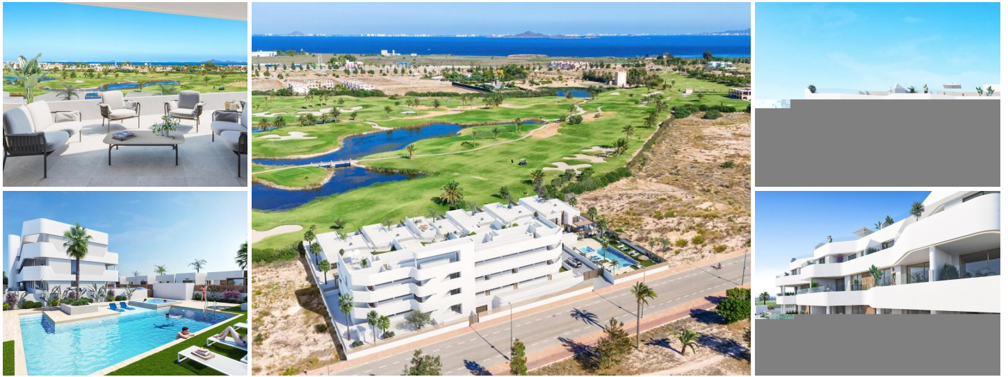
New Build Residential complex in Los Alcazares

Los Alcázares is an idyllic location for those looking to invest in a new residential property on the Costa Cálida. Just 25 minutes from Murcia Airport and approximately 55 minutes from Alicante Airport, this area is conveniently connected by highway to major cities like Cartagena, Murcia, and Alicante, as well as to other beautiful beaches along the Costa Cálida and Costa Blanca.