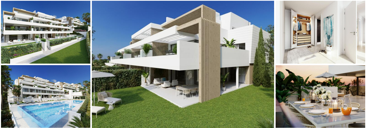
2 Bedroom ground floor apartment with private garden in Las Mesas area of Estepona

LIF3 is a new under-construction development where modern living meets exceptional comfort! This exclusive residential enclave offers 40 thoughtfully designed homes featuring 2 and 3 bedrooms, each adorned with expansive terraces. Choose from ground floors with generous gardens or duplex penthouses boasting dreamy terraces for unique and special moments with your loved ones.