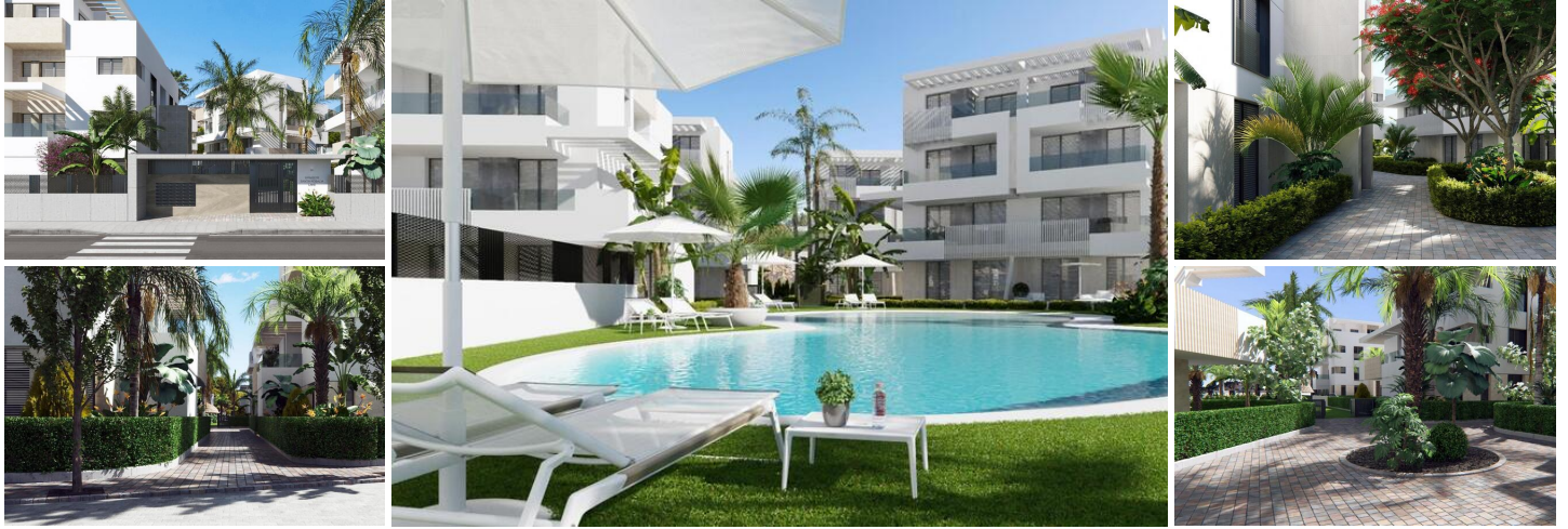
NEW BUILD APARTMENTS IN PRIVATE GATED RESORT IN PROVINCE OF MURCIA

New Build residential complex of 6 blocks, a total of 42 apartments.