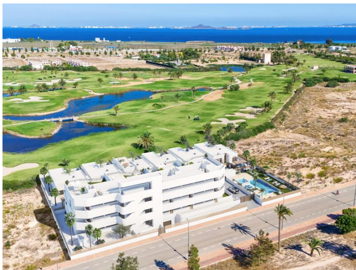
New Build Residential complex in Los Alcazares

Los Alcázares is an idyllic location for those looking to invest in a new residential property on the Costa Cálida. Just 25 minutes from Murcia Airport and approximately 55 minutes from Alicante Airport, this area is conveniently connected by highway to major cities like Cartagena, Murcia, and Alicante, as well as to other beautiful beaches along the Costa Cálida and Costa Blanca.