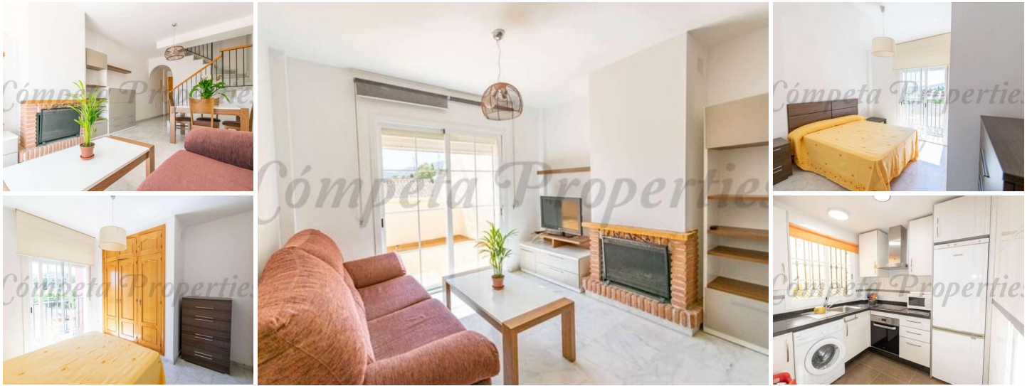
Bright and Spacious 3 Bedroom Townhouse in La Noria, Nerja

Located in the peaceful La Noria area of Nerja, this charming townhouse combines the tranquility of rural living with the convenience of nearby amenities. Positioned between Nerja and Frigiliana, and within easy reach of the LIDL supermarket and main roads, this home offers the perfect balance of seclusion and accessibility.