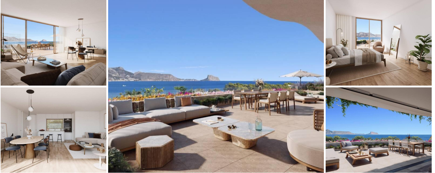
NEW BUID LUXURY COMPLEX OF APARTMENTS IN ALBIR

Luxury complex located in Costa Blanca close to the Playa del Albir.