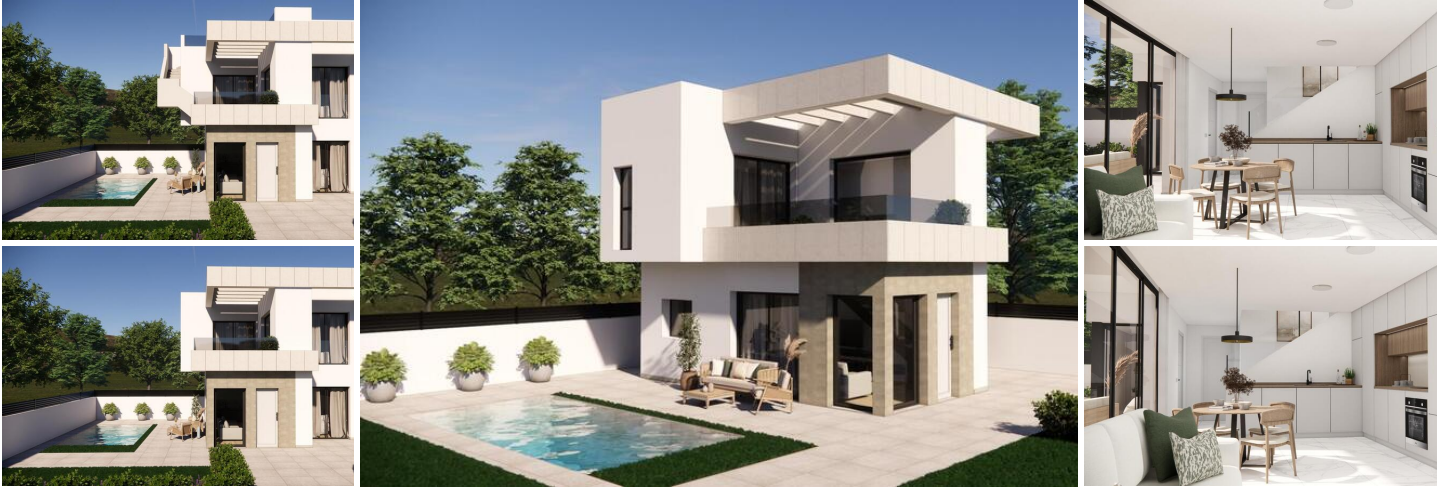
Elegant New Build Villas in Los Montesinos – Modern Comfort in a Serene Setting