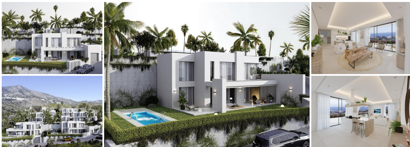
New Build Luxury Villas in Mijas

New build unique development of exclusive four-bedroom villas boasting spectacular views, contemporary architectural style, and the latest in-home technology.