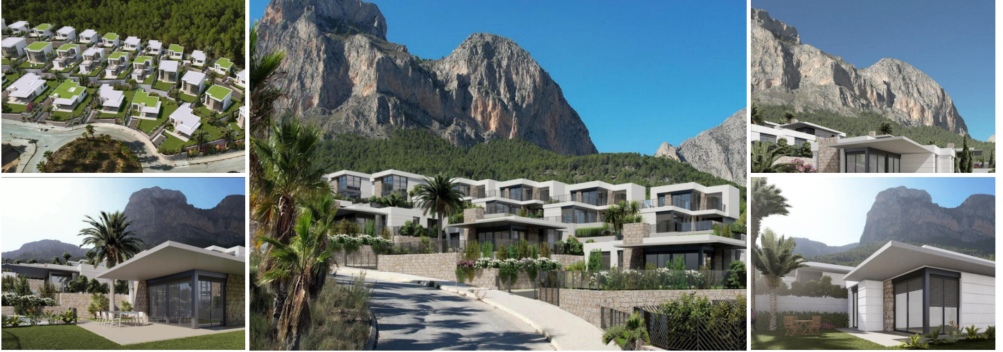
New Construction Villas in Polop, Alicante