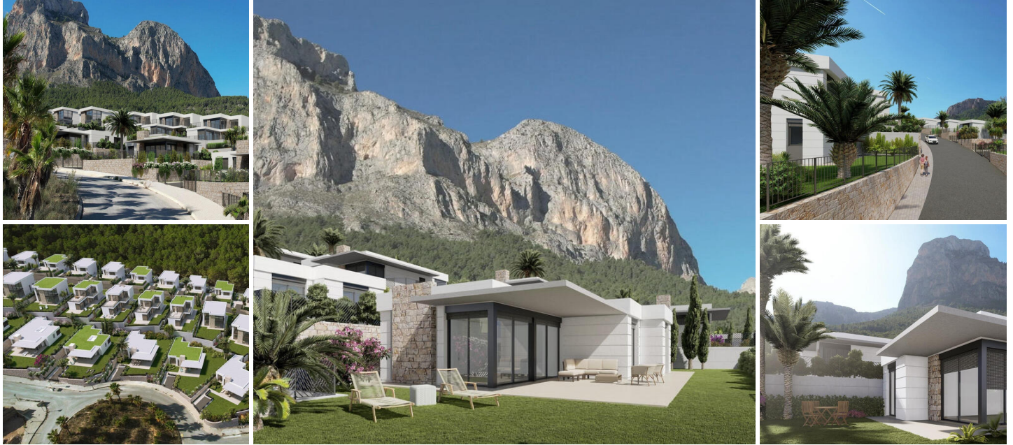
New Construction Villas in Polop, Alicante